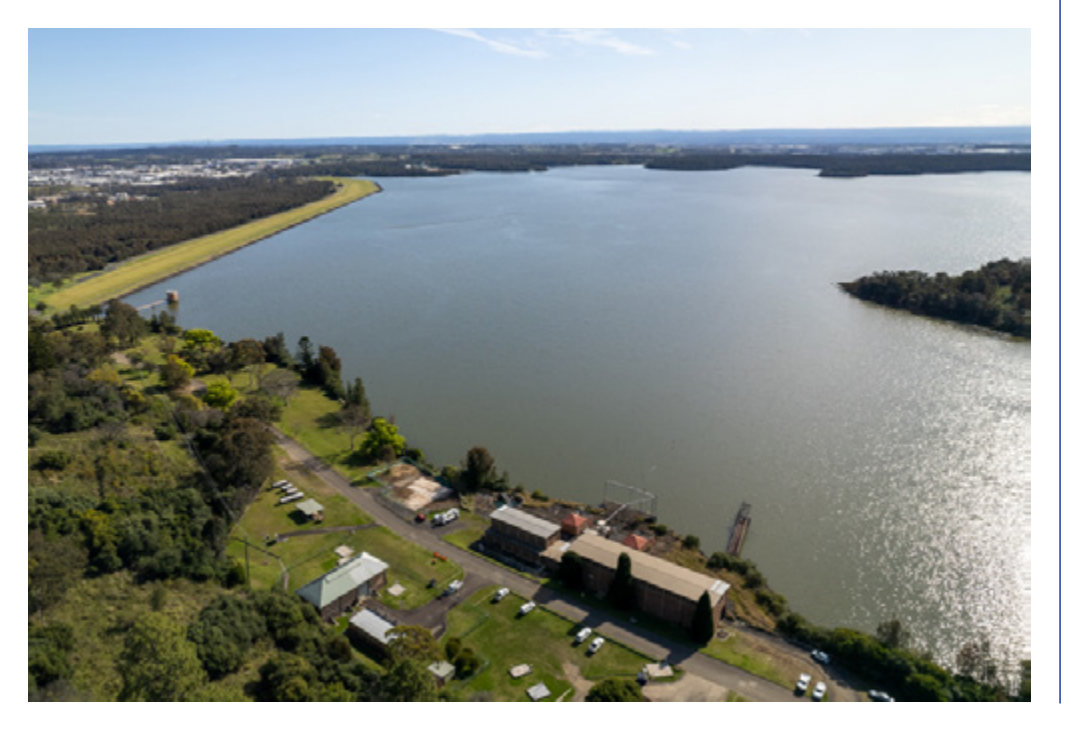
Sydney Water | Prospect Pre-Treatment Plant Augmentation and Upgrade

Improving the reliability and resilience of drinking water in Greater Sydney