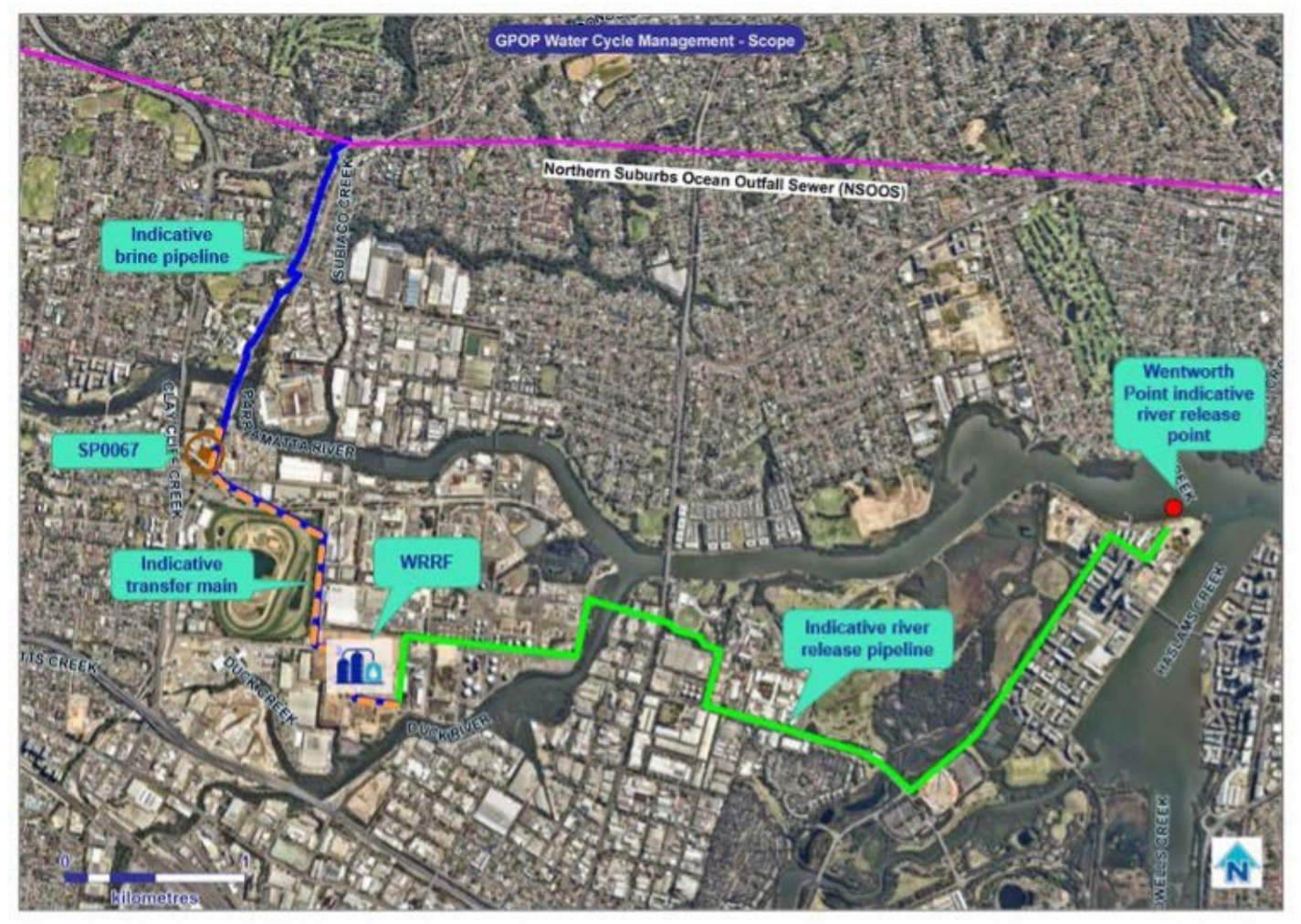
Preliminary alignments subject to site investigations and detailed optioneering