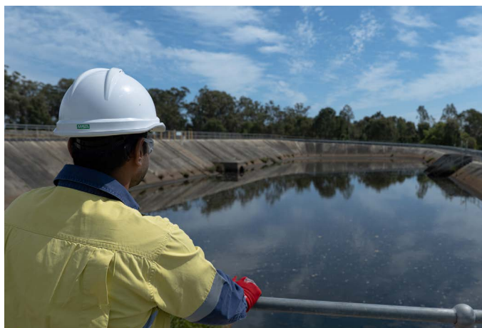
The upgrade includes building new assets and repurposing old assets.