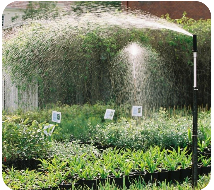
Stormwater is collected, treated and used to irrigate Randwick Council's native plant nursery