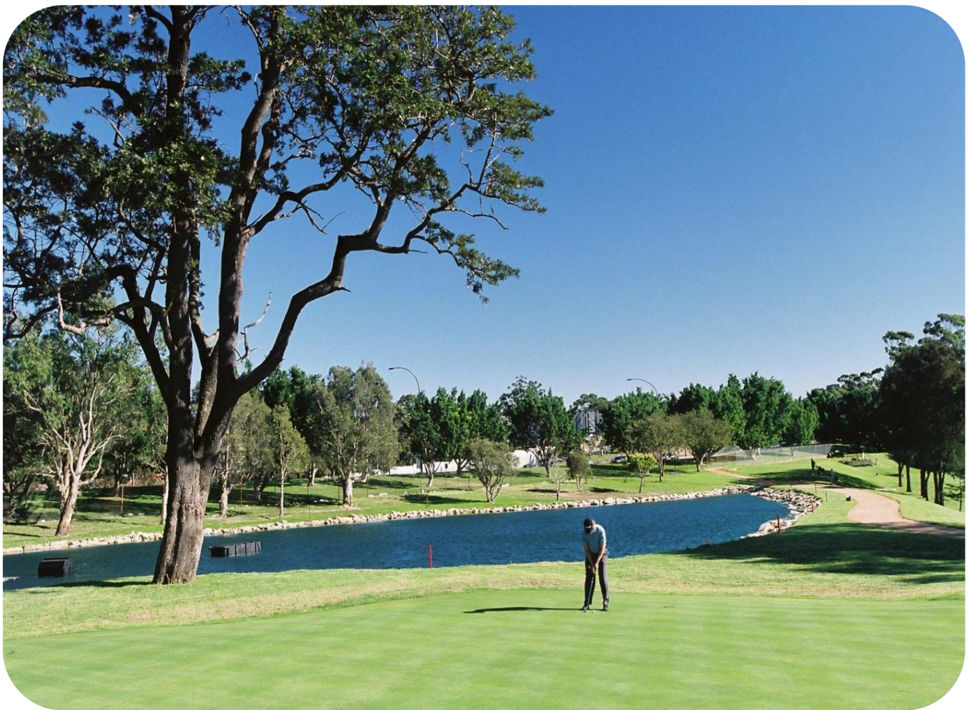
Filtered stormwater is added to the dam at Cammeray Golf Club and is used to irrigate the course