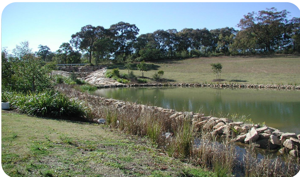
This wet basin collects stormwater to help reduce flood risk to local properties

The Additional Services Agreement applies to services that aren't covered by Sydney Water's Customer Contract . It outlines the terms under which Sydney Water provides these additional services and your rights and obligations. More information about the Additional Services Agreement is available at sydneywater.com.au .