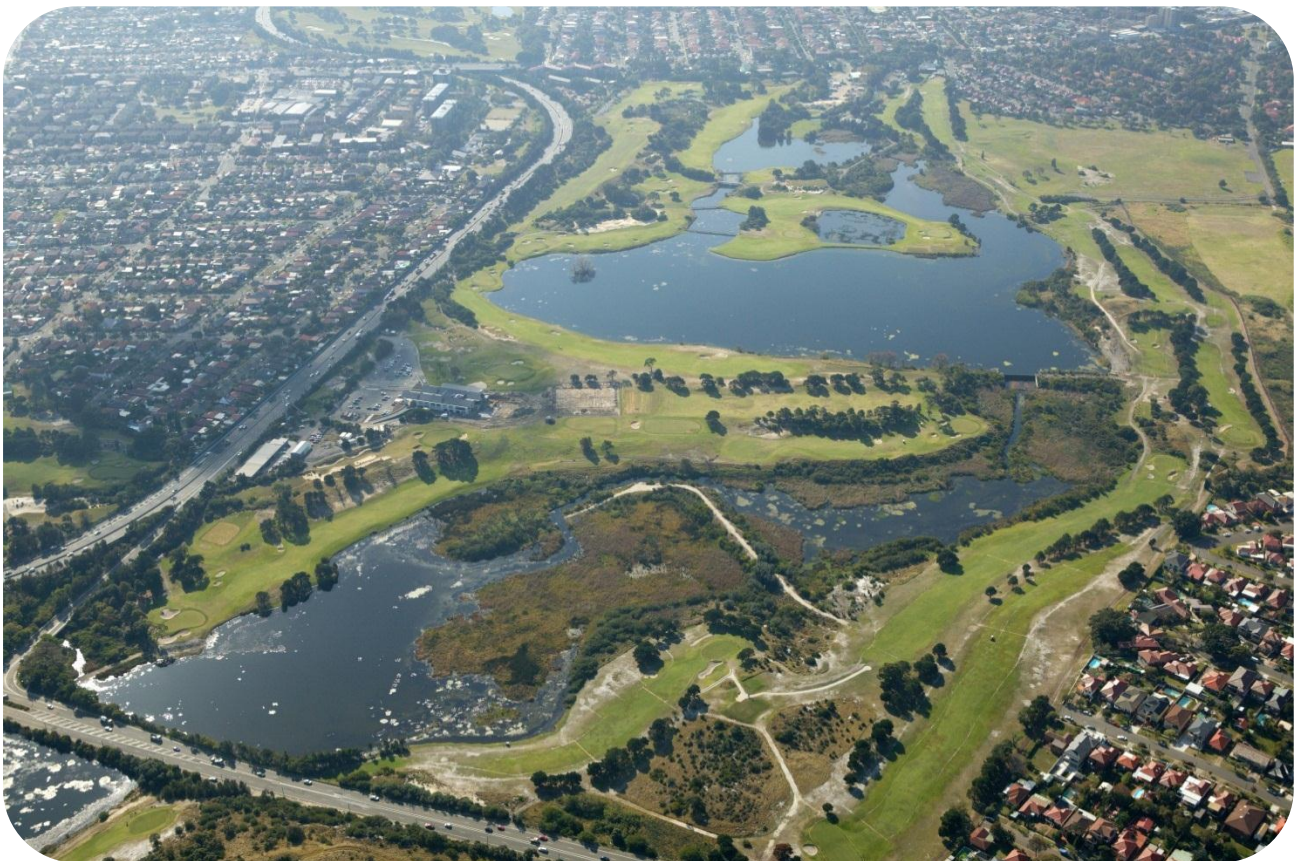
Botany Wetlands rely on stormwater flows to ensure aquatic plants and animals are kept healthy

These constraints may affect the cost, design and feasibility of your proposed stormwater harvesting scheme.