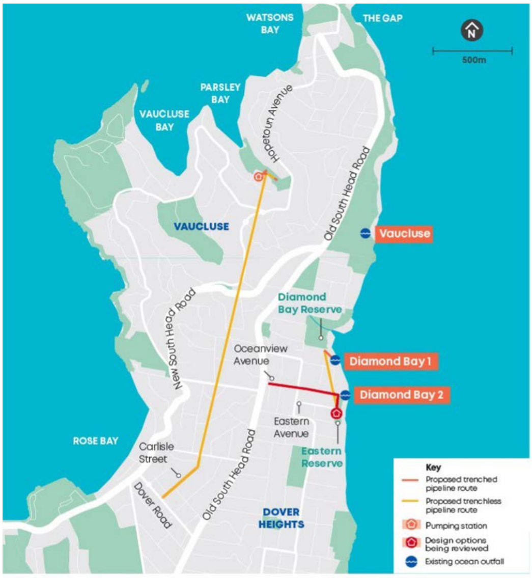
Map is indicative and not to scale – proposed locations are subject to change during the detailed design phase