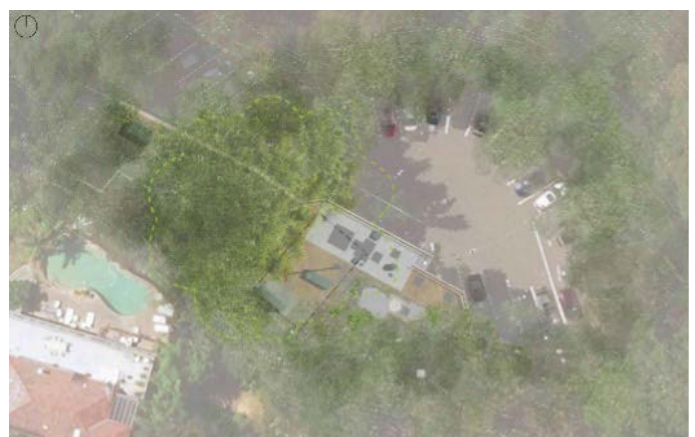
A wastewater pump station will be built in the footprint of the current amenities block.

Reduce environmental risks to aquatic ecosystems on the Vaucluse peninsula