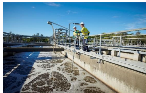
Sampling mixed liquor in aeration phase.

You can help us reduce nutrient loads in wastewater by choosing eco-friendly products. Find out other ways you can help on our Wastewater treatment webpage.