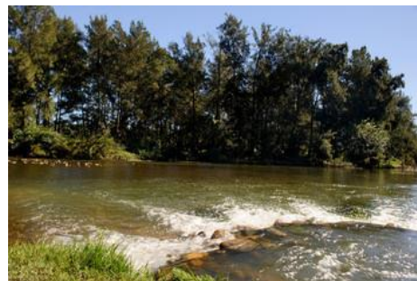
High quality recycled water keeping creeks and rivers healthy.

Wastewater that comes into our treatment plants are about 99% water! What's in the other one per cent?