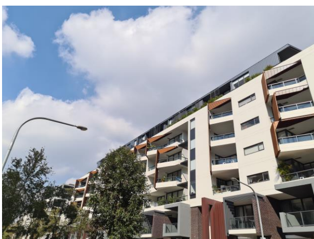
Apartments with balconies improve the liveability.