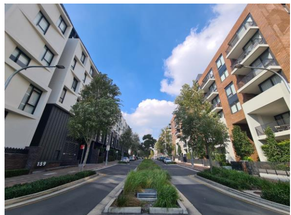
Ross street, Annandale.