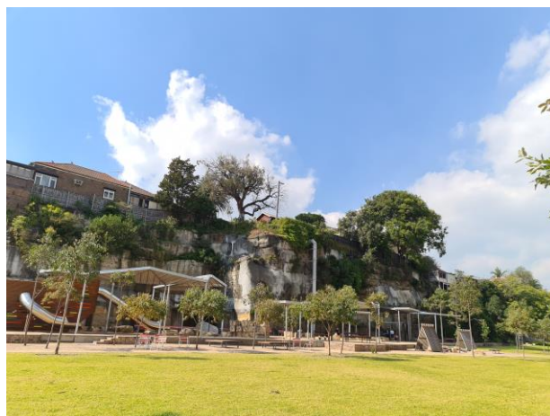
Harold Park adds to the open green space.

Around 2,500 residents and 500 workers are part of the Harold Park development. Originally it was used for horse racing and as a tram depot.